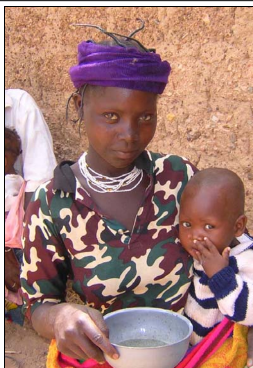
LLC distribution in Burkina Faso - Enfants du Monde -

APEF can be justifiably proud of the results achieved during its 16 years of existence. Our foremost aim was to demonstrate that the nutritional content of lucerne leaf concentrate (LLC) – proteins, vitamin A and iron especially, but also calcium, magnesium and folic acid – has a significant effect against a spectrum of health disorders related to qualitative food deficiencies. Such disorders include anaemia, problems with vision, weakening of the immune system (including in people with HIV) and physical and mental underdevelopment, especially in children. To date, some 500 tonnes of LLC - that is, approximately 60 million daily portions - have already been distributed by APEF. More than 50,000 people across the world, the majority school-age children, but also expectant or nursing mothers and infants, consume LLC every day.