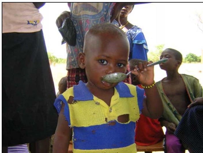
LLC distribution in Burkina Faso - Enfants du Monde -

This great news is a tribute to the 10 years of hard work by professionals working with lucerne. The application was initially submitted by “France Lucerne” in 1999 and has been carried through, with remarkable perseverance, since 2006 by LRD (Luzerne Research & Development), which represents the main Lucerne producers in Champagne-Ardenne.